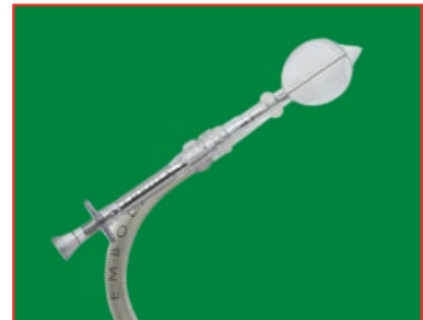
Edwards EMBOL-X Glide™ Protection System