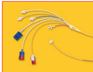
Edwards Swan-Ganz® Advanced Catheters