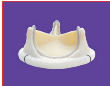
Carpentier-Edwards® PERIMOUNT® Pericardial Bioprosthesis

In recent years, Edwards Lifesciences has donated more than $600,000 worth of cardiovascular supplies, including much-needed heart valves – to AmeriCares. Edwards Lifesciences' donations have been delivered to many locations around the globe, including Cambodia, Guatemala, Dominican Republic, El Salvador, Armenia and Lebanon. Edwards Lifesciences' products, combined with AmeriCares humanitarian assistance, have helped tackle the challenges of chronic disease and have increased access to treatment for some of the world's most underserved populations.