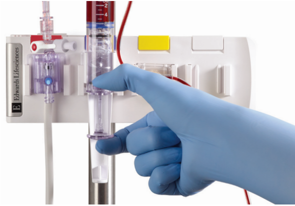
TruClip holder shown with Edwards VAMP closed blood sampling system.

The TruClip holder can be used to help reduce equipment clutter in the OR, ICU, ED and Cardiac Catheter labs.